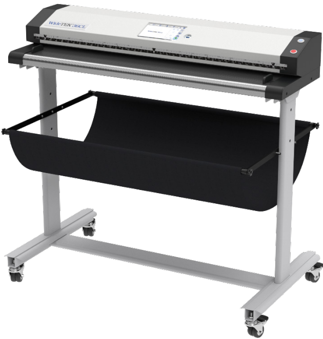
WT36 Stand with paper catch

The paper catch can be mounted at three different heights, without a tool. In addition, the catch can be mounted off center, to allow a greater input area in the back or in the front.