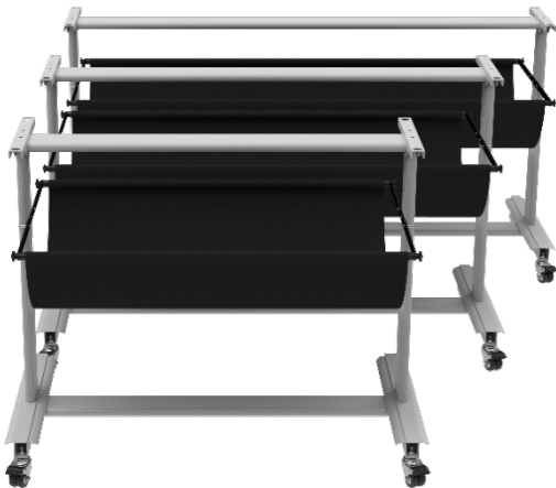
Three stands for all WideTEK sheetfeed scanners.